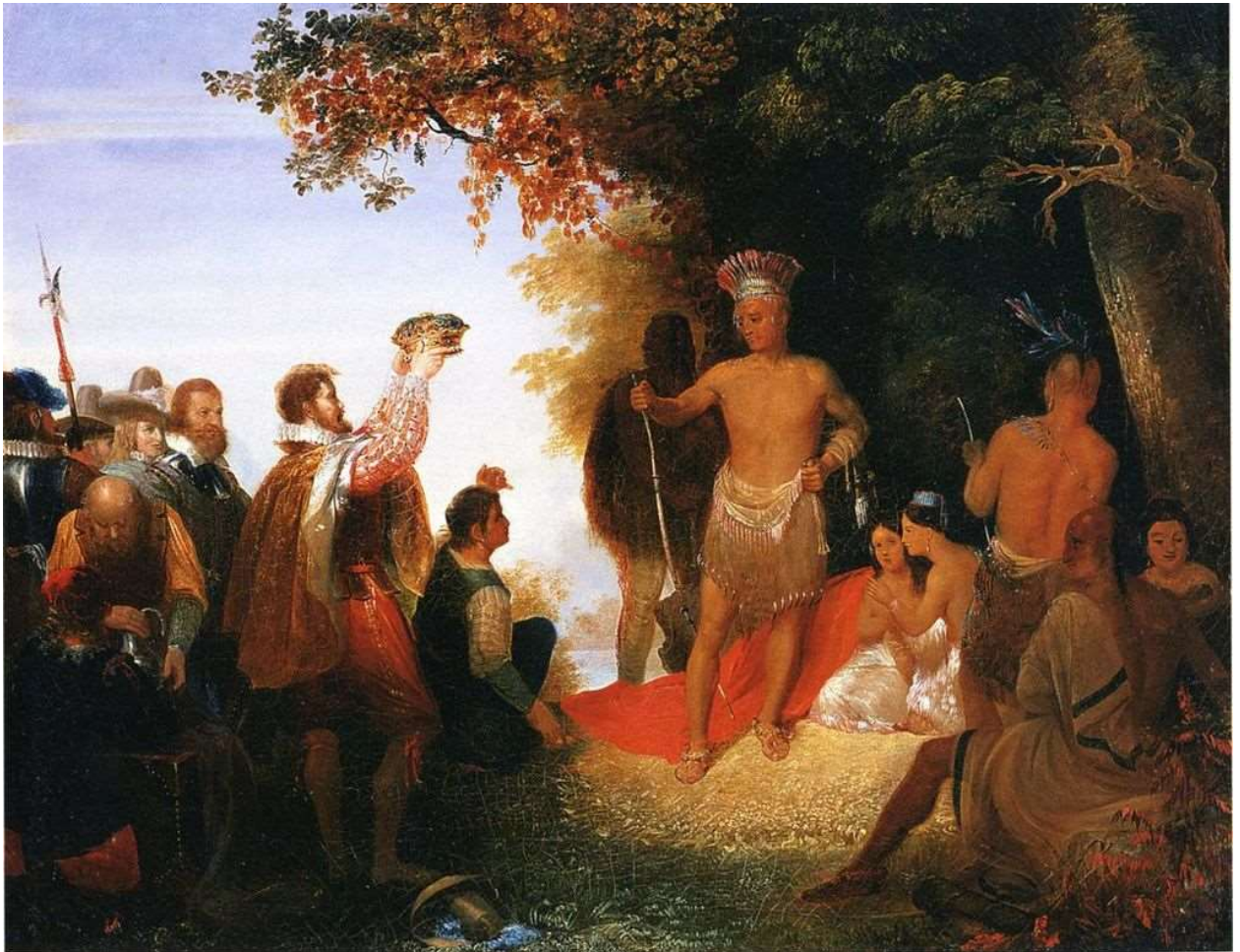
The Coronation of Powhatan, John Gadsby Chapman, 1835

Activity 2 Powhatan Village links and images Larger pictures for viewing or printing are in the Art Prints folder