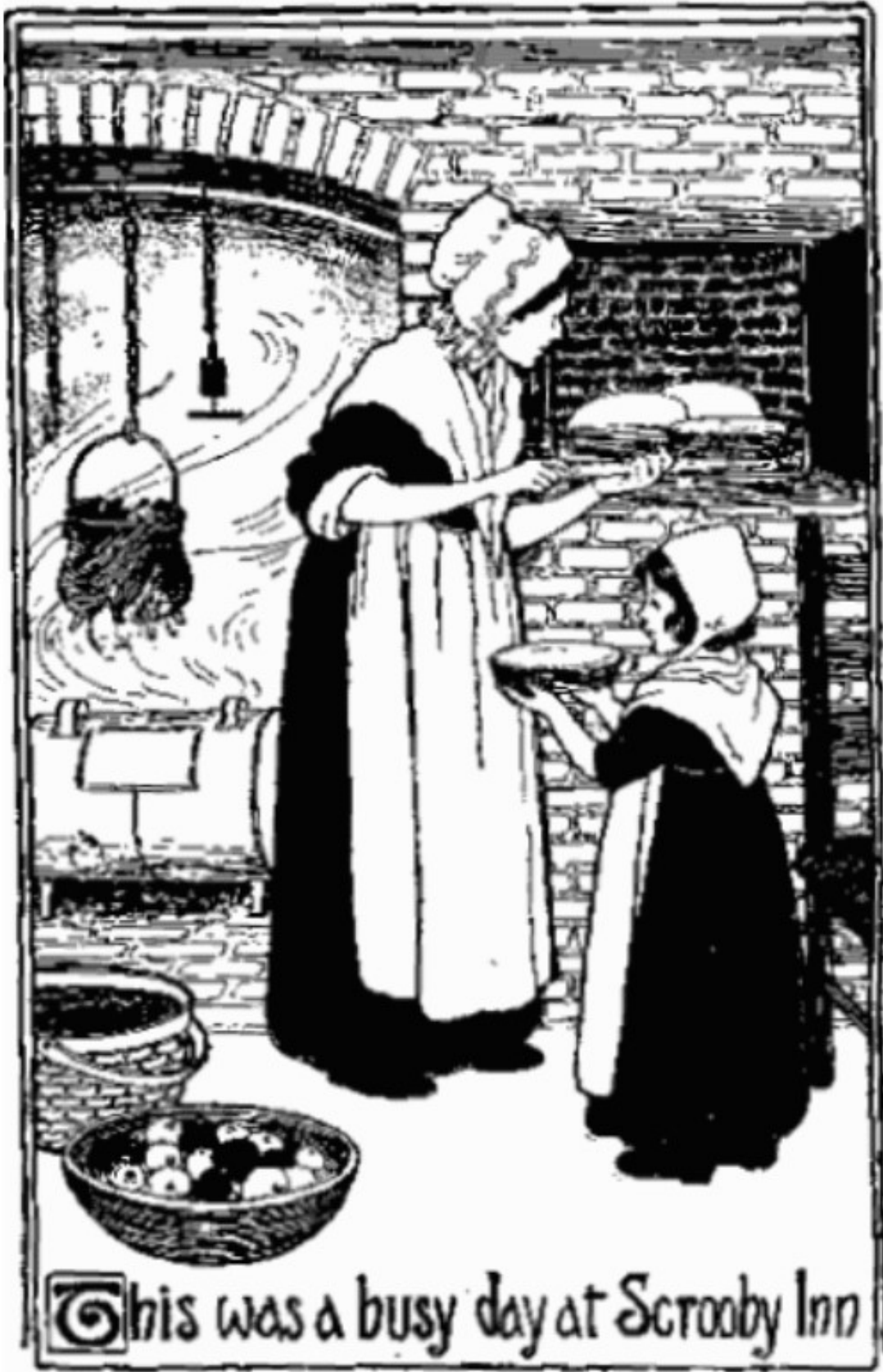
This was a busy day at Scrooby Inn