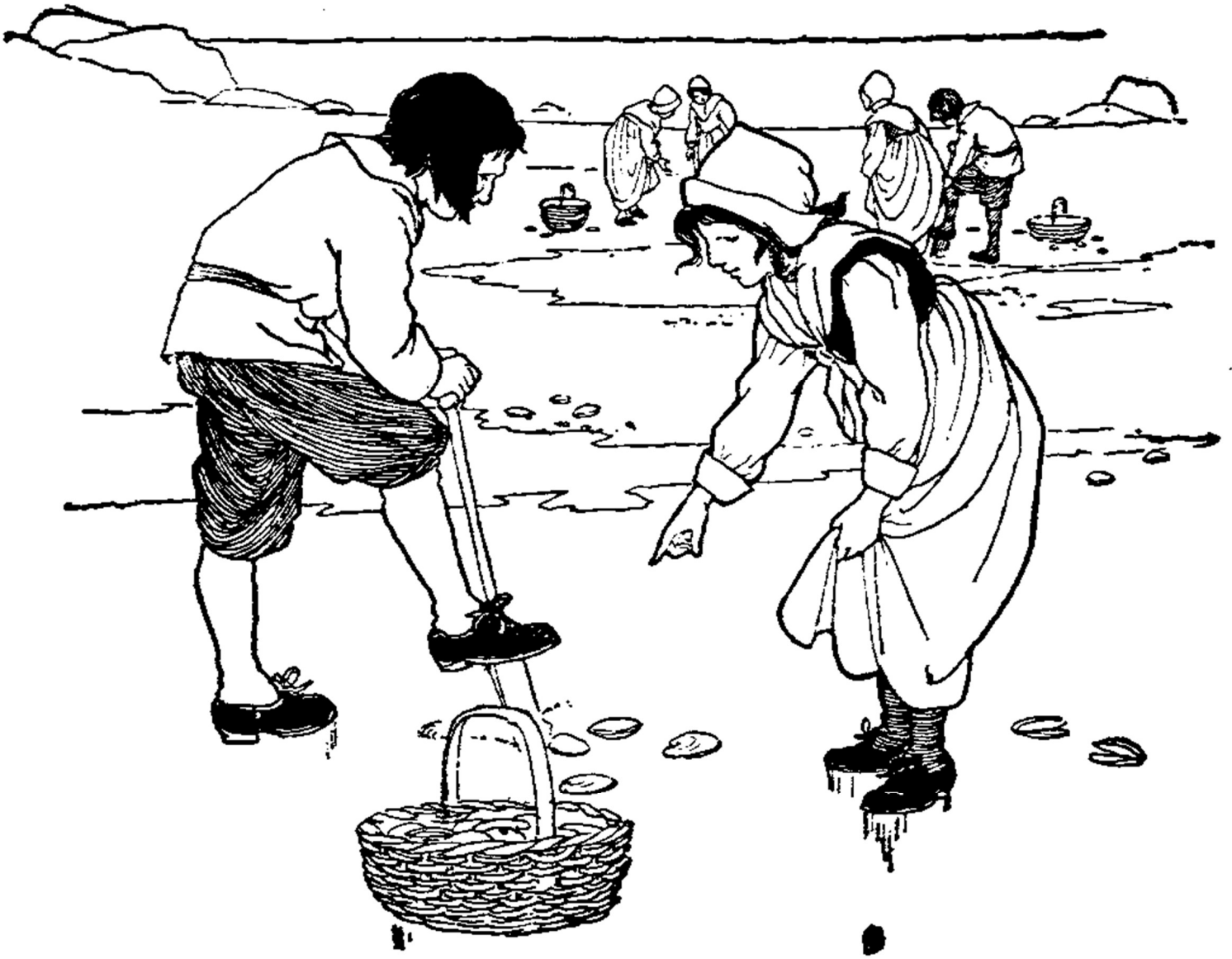
"The boys and girls . . . went to the beach to dig clams"